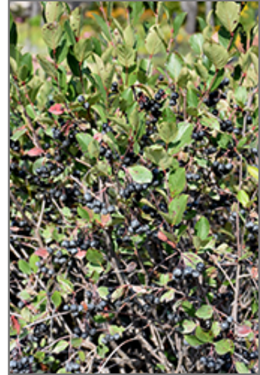
Black Chokeberry fruit

Black Chokeberry is recommended for the following landscape applications;