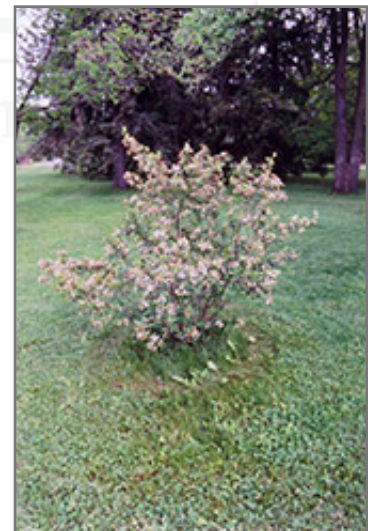
Black Chokeberry in bloom