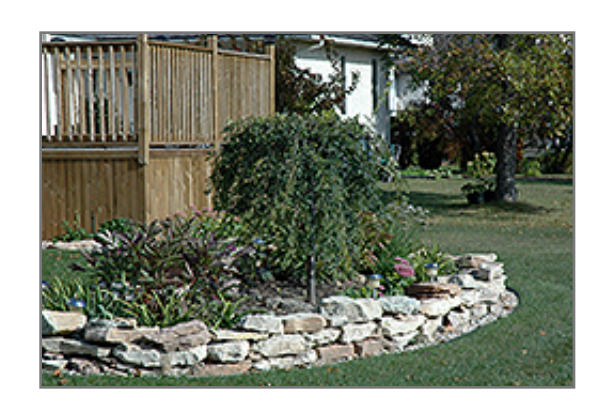
Weeping Peashrub

This shrub does best in full sun to partial shade. It prefers dry to average moisture levels with very well-drained soil, and will often die in standing water. It is considered to be drought-tolerant, and thus makes an ideal choice for xeriscaping or the moisture-conserving landscape. It is not particular as to soil type or pH, and is able to handle environmental salt. It is highly tolerant of urban pollution and will even thrive in inner city environments. This is a selected variety of a species not originally from North America.