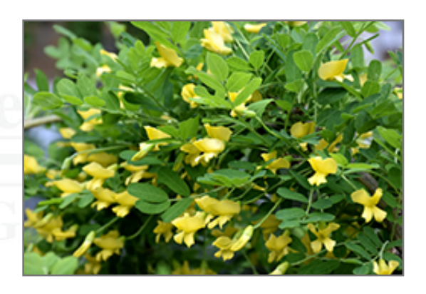
Weeping Peashrub flowers