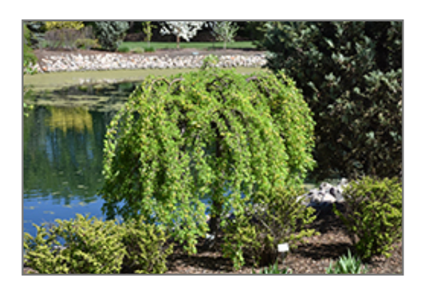
Weeping Peashrub

Weeping Peashrub is recommended for the following landscape applications;