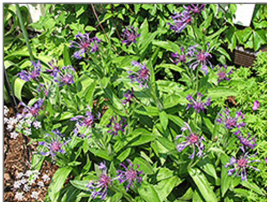
Blue Cornflower in bloom

Blue Cornflower is an herbaceous perennial with an upright spreading habit of growth. Its medium texture blends into the garden, but can always be balanced by a couple of finer or coarser plants for an effective composition.