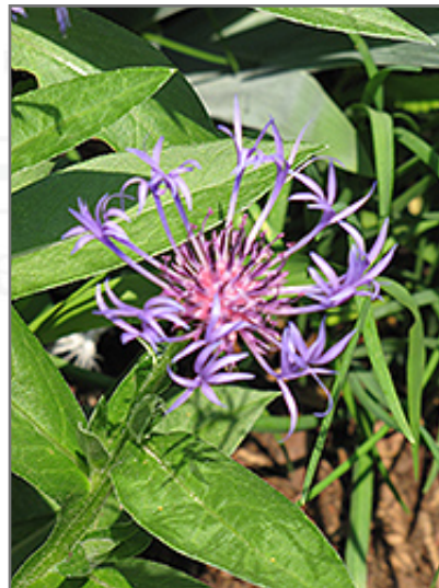
Blue Cornflower flowers