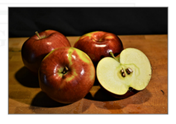
Empire Apple fruit and flesh