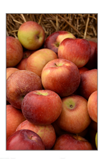
Empire Apple fruit