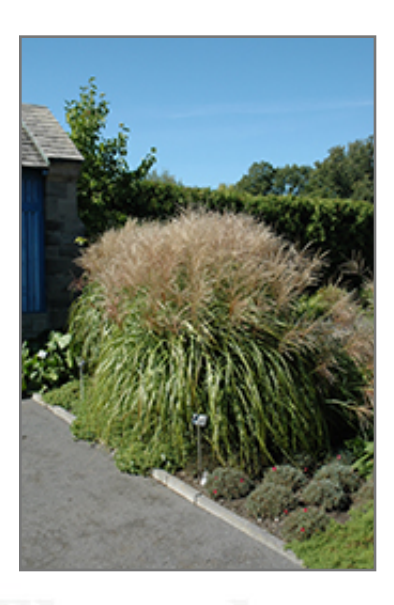
Huron Sunrise Maiden Grass

Huron Sunrise Maiden Grass is recommended for the following landscape applications;