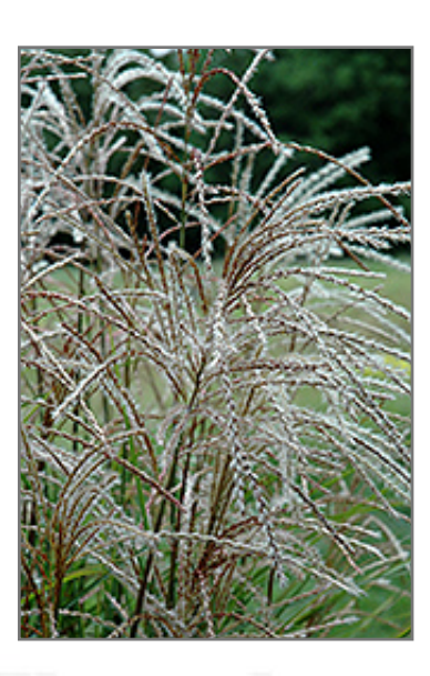
Huron Sunrise Maiden Grass flowers

This plant does best in full sun to partial shade. It prefers to grow in average to moist conditions, and shouldn't be allowed to dry out. It is not particular as to soil type or pH. It is highly tolerant of urban pollution and will even thrive in inner city environments. This is a selected variety of a species not originally from North America. It can be propagated by division; however, as a cultivated variety, be aware that it may be subject to certain restrictions or prohibitions on propagation.