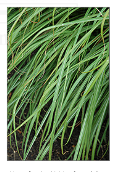
Huron Sunrise Maiden Grass foliage