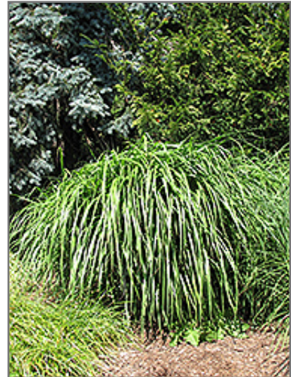
Malepartus Maiden Grass