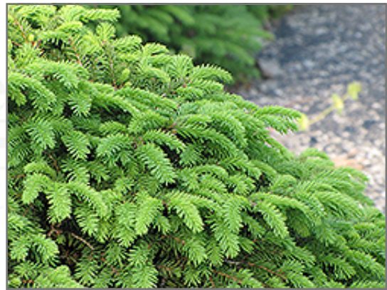
Birds Nest Spruce foliage