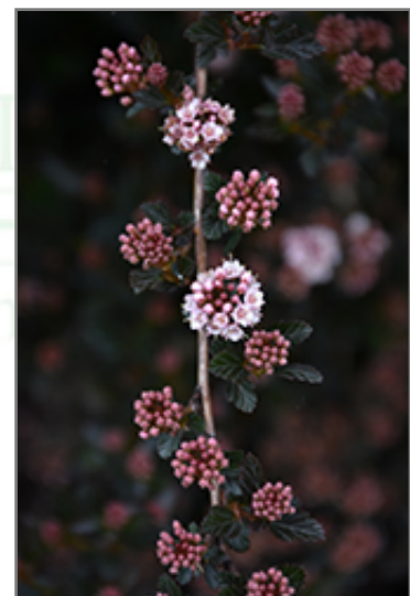
Little Devil Ninebark flowers