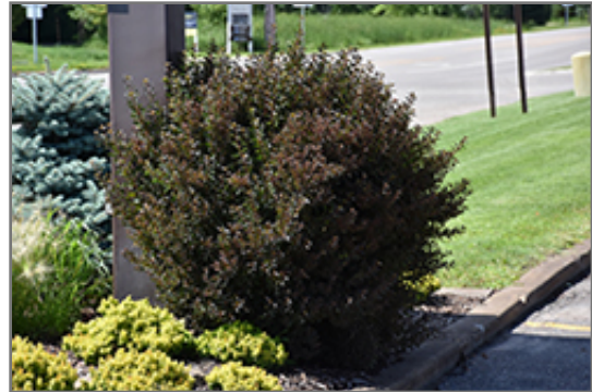
Little Devil Ninebark

Little Devil Ninebark is recommended for the following landscape applications;