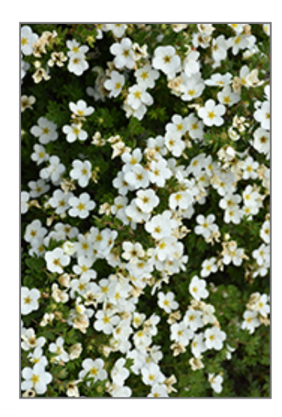
Abbotswood Potentilla flowers

This is a relatively low maintenance shrub, and is best pruned in late winter once the threat of extreme cold has passed. It is a good choice for attracting butterflies to your yard, but is not particularly attractive to deer who tend to leave it alone in favor of tastier treats. It has no significant negative characteristics.