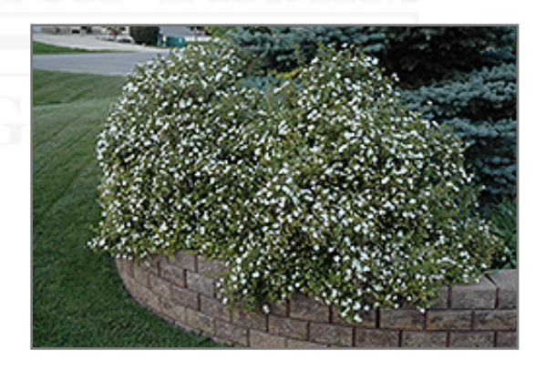
Abbotswood Potentilla in bloom