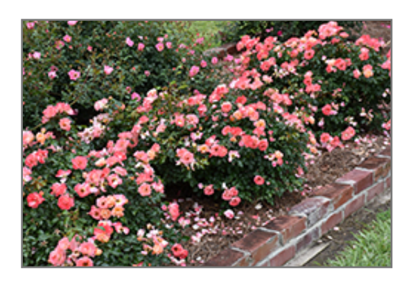
Peach Drift Rose in bloom

Peach Drift Rose will grow to be about 18 inches tall at maturity, with a spread of 24 inches. It tends to fill out right to the ground and therefore doesn't necessarily require facer plants in front. It grows at a fast rate, and under ideal conditions can be expected to live for approximately 20 years.