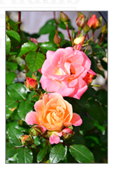
Peach Drift Rose flowers