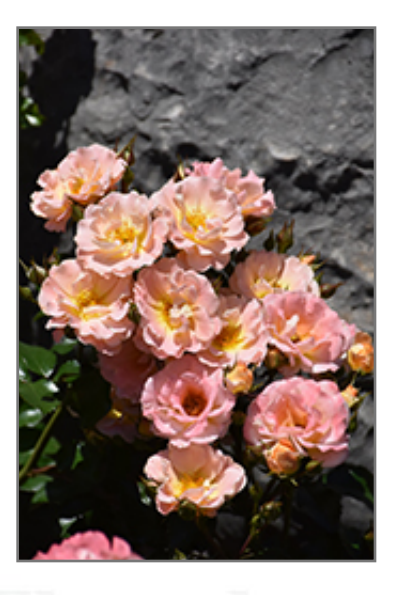
Peach Drift Rose flowers

This is a high maintenance shrub that will require regular care and upkeep, and is best pruned in late winter once the threat of extreme cold has passed. It is a good choice for attracting bees and butterflies to your yard. Gardeners should be aware of the following characteristic(s) that may warrant special consideration;