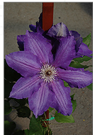
Vancouver Danielle Clematis flowers