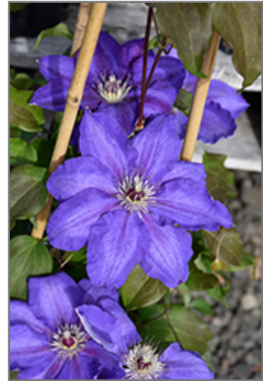
Vancouver Danielle Clematis flowers

Vancouver Danielle Clematis is recommended for the following landscape applications;