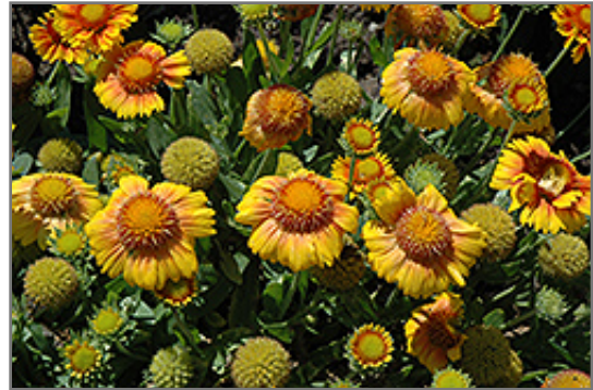
Arizona Apricot Blanket Flower flowers

Arizona Apricot Blanket Flower is recommended for the following landscape applications;