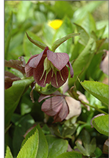
Blue Lady Hellebore flowers

Blue Lady Hellebore is recommended for the following landscape applications;