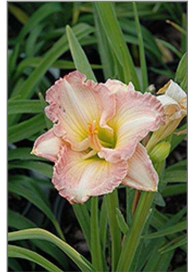
Frosted Vintage Ruffles Daylily flowers