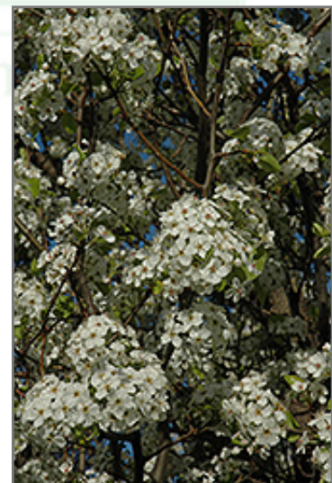
Chanticleer Ornamental Pear flowers