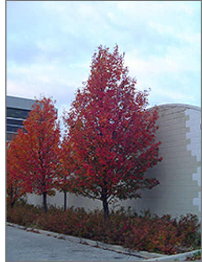
Chanticleer Ornamental Pear in fall

This tree should only be grown in full sunlight. It prefers to grow in average to moist conditions, and shouldn't be allowed to dry out. It is not particular as to soil type or pH. It is highly tolerant of urban pollution and will even thrive in inner city environments. This is a selected variety of a species not originally from North America.