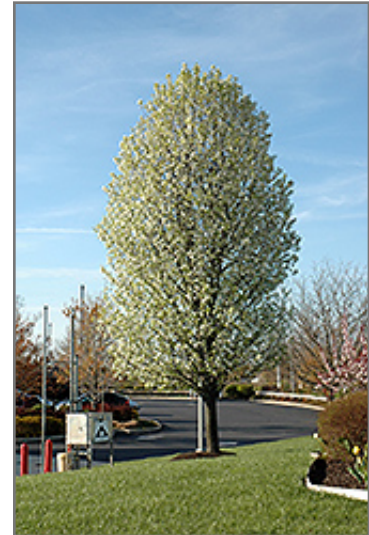
Chanticleer Ornamental Pear in bloom