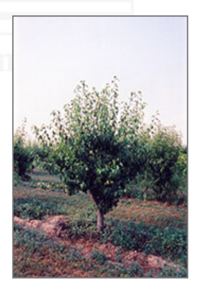
Anjou Pear