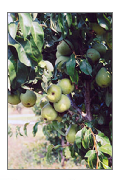
Anjou Pear fruit

Anjou Pear is bathed in stunning clusters of white flowers with purple anthers along the branches in early spring. It has forest green deciduous foliage. The glossy pointy leaves turn an outstanding deep purple in the fall. The fruits are showy green pears with a red blush, which are carried in abundance in early fall. The fruit can be messy if allowed to drop on the lawn or walkways, and may require occasional clean-up.