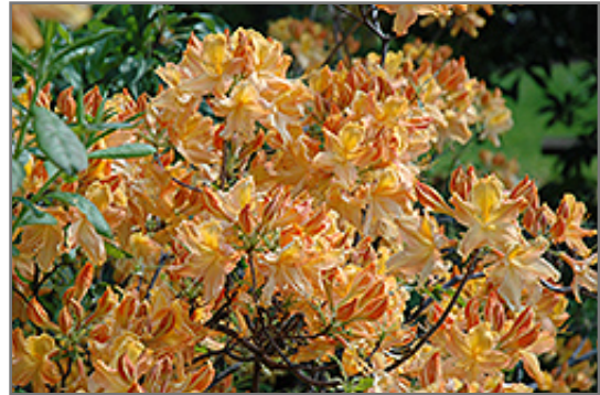
Golden Lights Azalea flowers

Golden Lights Azalea is recommended for the following landscape applications;