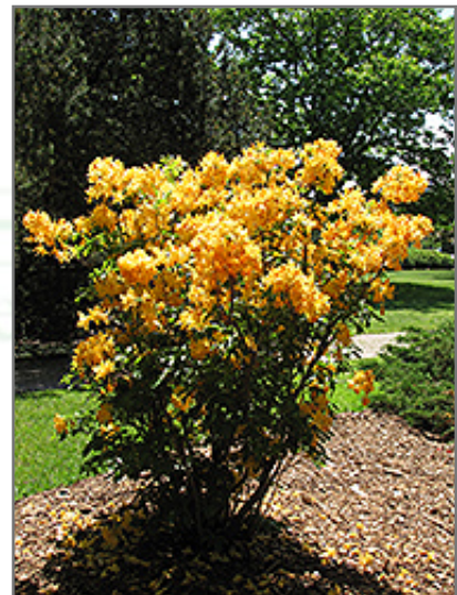
Golden Lights Azalea in bloom