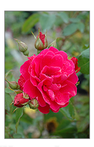
George Vancouver Rose flowers

An Explorer series Rose, with an abundance of double cherry-red flowers in early summer, repeat-blooming; compact mounded habit, hardy and resistant to disease, a most beautiful garden shrub; all Roses need full sun and well-drained soil