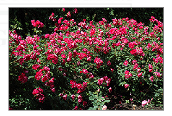
George Vancouver Rose in bloom

George Vancouver Rose is a multi-stemmed deciduous shrub with an upright spreading habit of growth. Its average texture blends into the landscape, but can be balanced by one or two finer or coarser trees or shrubs for an effective composition.