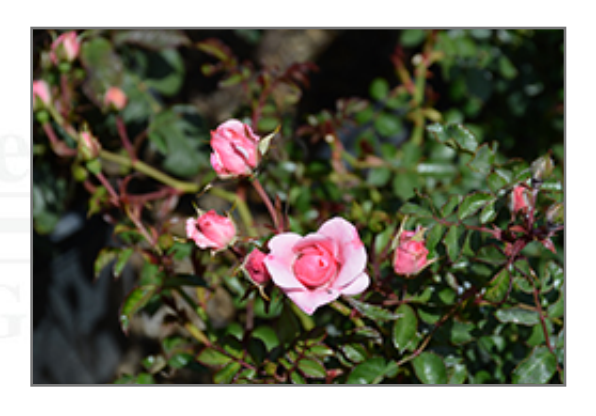
Bonica Rose flower buds

This is a high maintenance shrub that will require regular care and upkeep, and is best pruned in late winter once the threat of extreme cold has passed. Gardeners should be aware of the following characteristic(s) that may warrant special consideration;