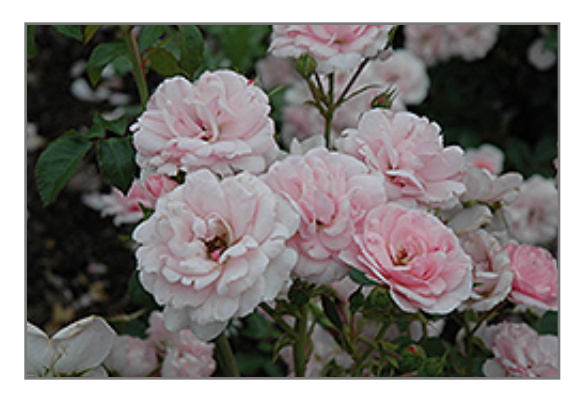
Bonica Rose flowers

Bonica Rose is a multi-stemmed deciduous shrub with an upright spreading habit of growth. Its average texture blends into the landscape, but can be balanced by one or two finer or coarser trees or shrubs for an effective composition.