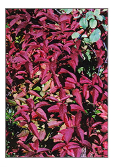
Bush Honeysuckle in fall

This shrub does best in full sun to partial shade. It is very adaptable to both dry and moist locations, and should do just fine under average home landscape conditions. It is not particular as to soil type or pH. It is highly tolerant of urban pollution and will even thrive in inner city environments. This species is native to parts of North America.