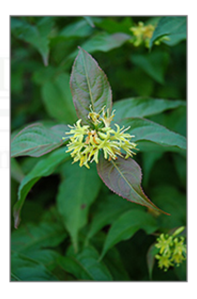
Bush Honeysuckle flowers