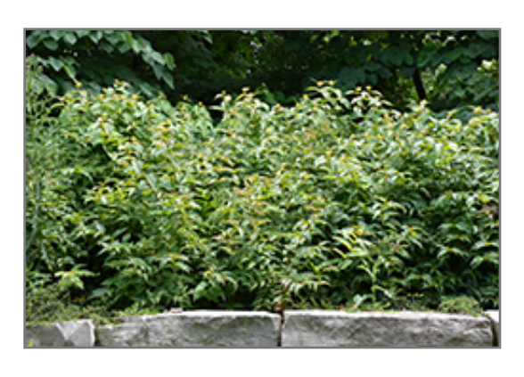
Bush Honeysuckle

This shrub will require occasional maintenance and upkeep, and is best pruned in late winter once the threat of extreme cold has passed. It is a good choice for attracting butterflies and hummingbirds to your yard. Gardeners should be aware of the following characteristic(s) that may warrant special consideration;