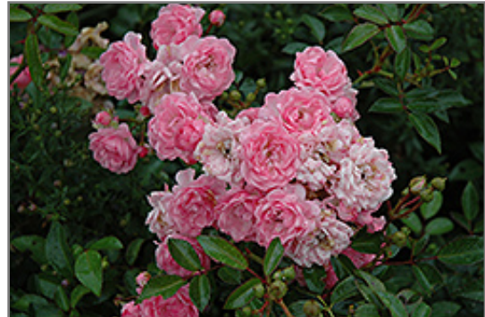
The Fairy Rose flowers

The Fairy Rose is recommended for the following landscape applications;