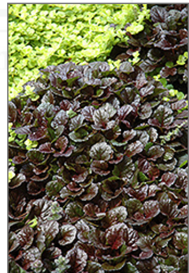
Black Scallop Bugleweed