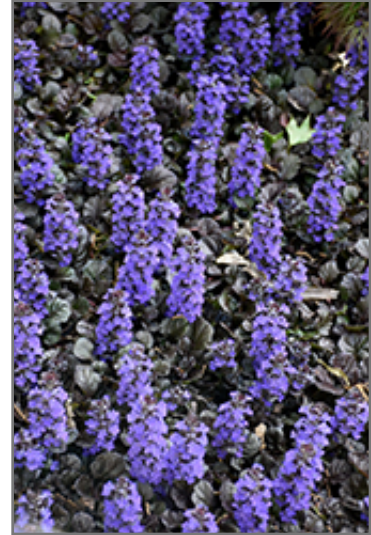
Black Scallop Bugleweed flowers