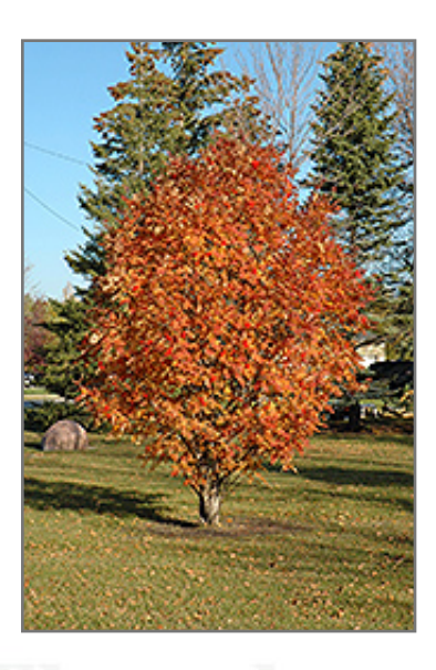
Cardinal Royal Mountain Ash in fall

This is a relatively low maintenance tree, and usually looks its best without pruning, although it will tolerate pruning. It is a good choice for attracting birds to your yard. Gardeners should be aware of the following characteristic(s) that may warrant special consideration;