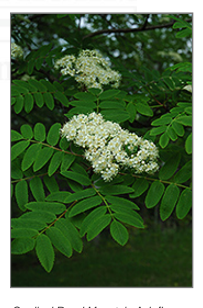
Cardinal Royal Mountain Ash flowers