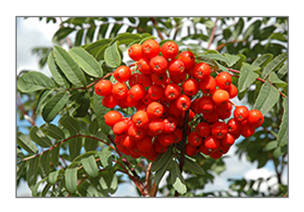
Cardinal Royal Mountain Ash fruit

Cardinal Royal Mountain Ash will grow to be about 30 feet tall at maturity, with a spread of 20 feet. It has a low canopy with a typical clearance of 4 feet from the ground, and should not be planted underneath power lines. It grows at a medium rate, and under ideal conditions can be expected to live for 50 years or more.