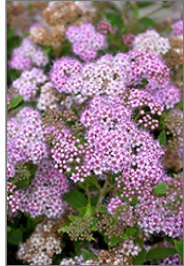
Little Princess Spirea flowers

This shrub will require occasional maintenance and upkeep, and is best pruned in late winter once the threat of extreme cold has passed. It is a good choice for attracting butterflies to your yard, but is not particularly attractive to deer who tend to leave it alone in favor of tastier treats. It has no significant negative characteristics.