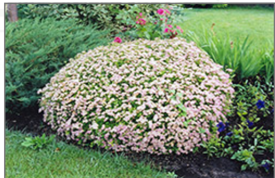
Little Princess Spirea in bloom