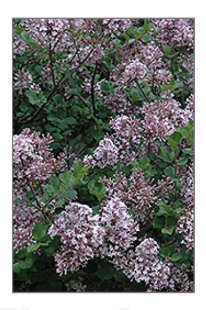
Dwarf Korean Lilac flowers

This is a relatively low maintenance shrub, and should only be pruned after flowering to avoid removing any of the current season's flowers. It is a good choice for attracting butterflies to your yard. It has no significant negative characteristics.