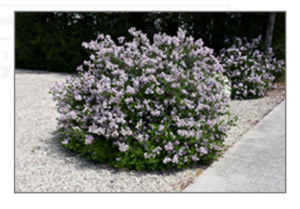
Dwarf Korean Lilac in bloom