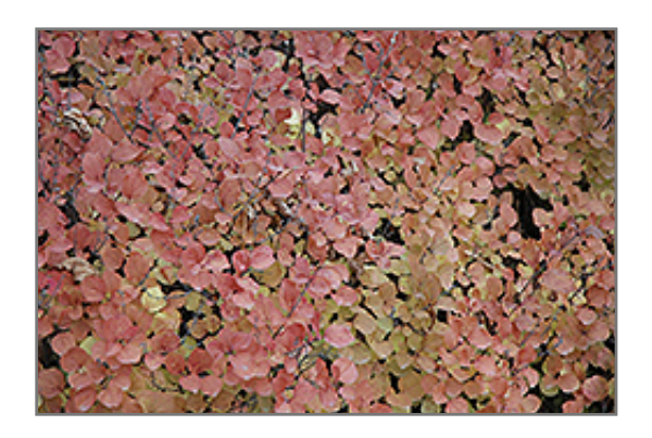
Dwarf Korean Lilac in fall

Dwarf Korean Lilac will grow to be about 4 feet tall at maturity, with a spread of 5 feet. It tends to fill out right to the ground and therefore doesn't necessarily require facer plants in front. It grows at a slow rate, and under ideal conditions can be expected to live for approximately 30 years.