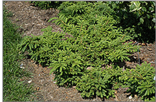
Emerald Spreader Yew

Emerald Spreader Yew is recommended for the following landscape applications;