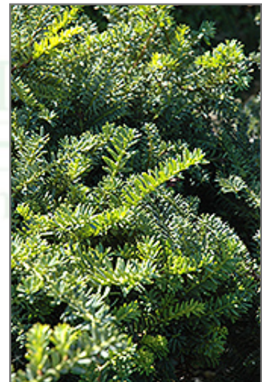
Emerald Spreader Yew foliage