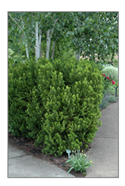
Hicks Yew

Hicks Yew is recommended for the following landscape applications;