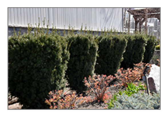
Hicks Yew

Hicks Yew will grow to be about 18 feet tall at maturity, with a spread of 10 feet. It has a low canopy with a typical clearance of 1 foot from the ground, and is suitable for planting under power lines. It grows at a slow rate, and under ideal conditions can be expected to live for 50 years or more.