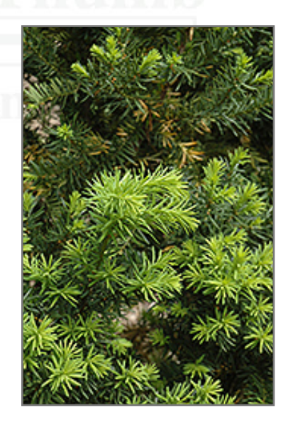
Hicks Yew foliage