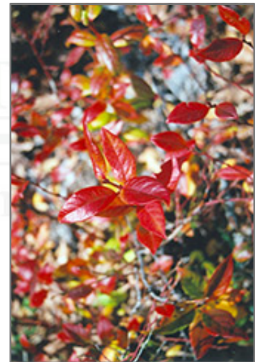
Northsky Blueberry in fall