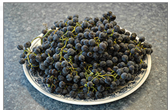
Frontenac Grape fruit