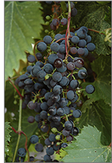
Frontenac Grape fruit

Frontenac Grape has rich green deciduous foliage on a plant with a spreading habit of growth. The lobed leaves turn yellow in fall. It produces abundant clusters of deep purple grapes with navy blue overtones from early to mid fall.