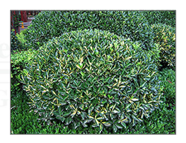
Moonshadow Wintercreeper

Moonshadow Wintercreeper is recommended for the following landscape applications;