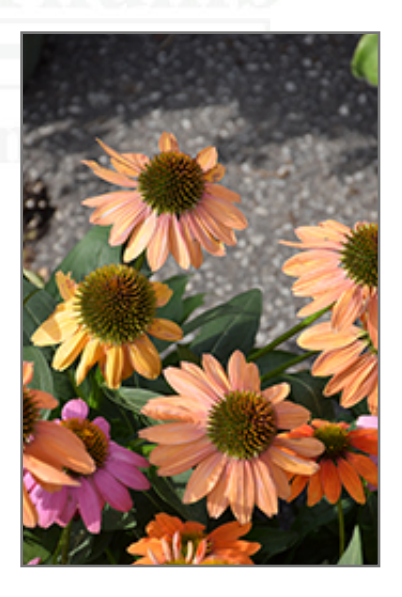
Cheyenne Spirit Coneflower flowers