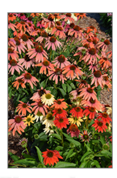
Cheyenne Spirit Coneflower in bloom

Cheyenne Spirit Coneflower is an herbaceous perennial with an upright spreading habit of growth. Its medium texture blends into the garden, but can always be balanced by a couple of finer or coarser plants for an effective composition.