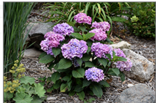
Bloomstruck Hydrangea in bloom