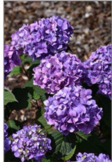
Bloomstruck Hydrangea flowers

This shrub will require occasional maintenance and upkeep, and should only be pruned after flowering to avoid removing any of the current season's flowers. It has no significant negative characteristics.