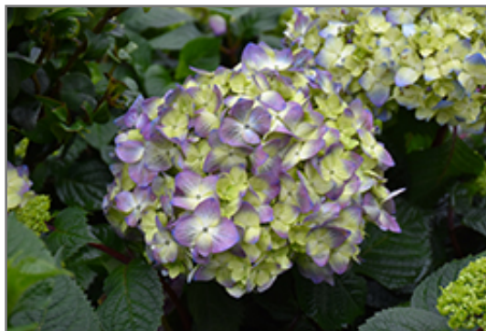
Bloomstruck Hydrangea flowers

Bloomstruck Hydrangea will grow to be about 4 feet tall at maturity, with a spread of 5 feet. It tends to fill out right to the ground and therefore doesn't necessarily require facer plants in front. It grows at a fast rate, and under ideal conditions can be expected to live for approximately 20 years.