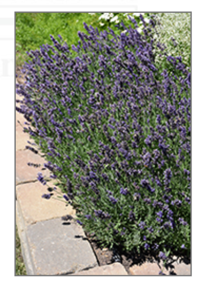
Ellagance Purple Lavender in bloom