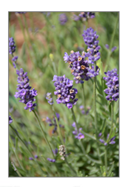
Ellagance Purple Lavender flowers

This is a relatively low maintenance shrub, and can be pruned at anytime. It is a good choice for attracting bees and butterflies to your yard, but is not particularly attractive to deer who tend to leave it alone in favor of tastier treats. It has no significant negative characteristics.