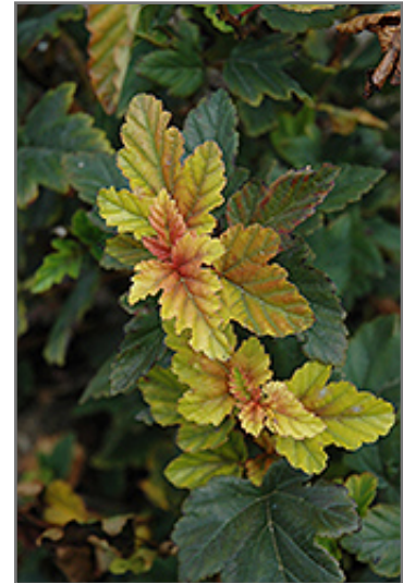
Gumdrop Caramel Candy Ninebark foliage