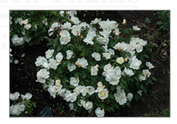
White Knock Out Rose in bloom