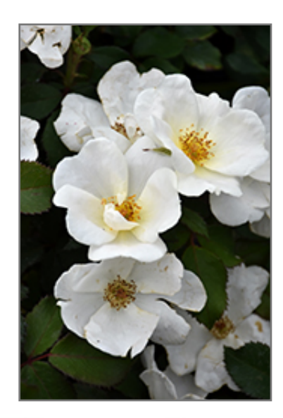
White Knock Out Rose flowers

This shrub will require occasional maintenance and upkeep, and is best pruned in late winter once the threat of extreme cold has passed. Gardeners should be aware of the following characteristic(s) that may warrant special consideration;