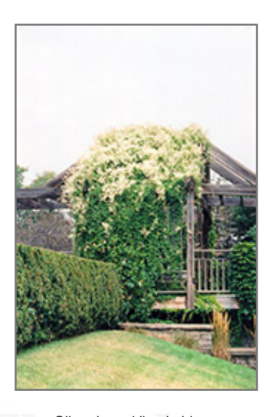
Silver Lace Vine in bloom

Silver Lace Vine is recommended for the following landscape applications;