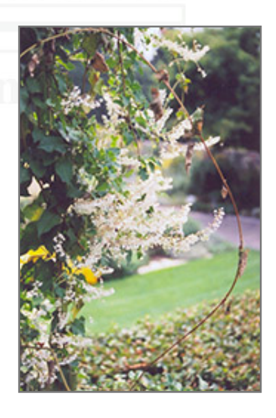
Silver Lace Vine flowers