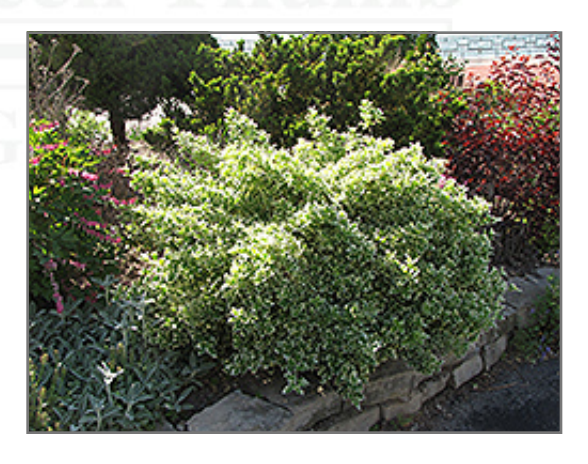
Emerald Gaiety Wintercreeper