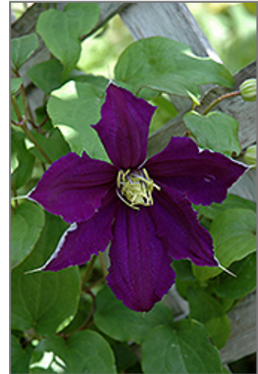
Rhapsody Clematis flowers