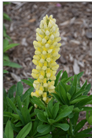
Popsicle Yellow Lupine flowers

A standout dwarf hybrid producing thick spikes of eye catching yellow-cream flowers; a tremendous visual impact when massed in the garden, in border plantings or containers