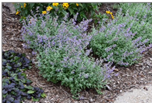
Purrsian Blue Catmint in bloom