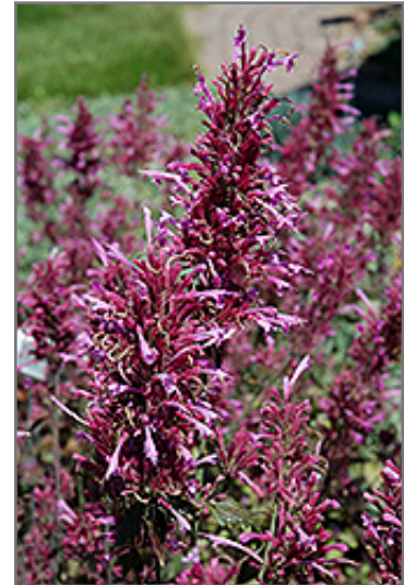
Bolero Hyssop flowers

Bolero Hyssop is recommended for the following landscape applications;