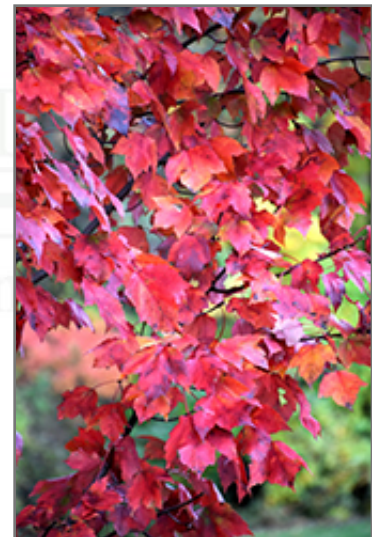
Red Maple in fall