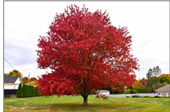
Red Maple in fall

Red Maple is recommended for the following landscape applications;