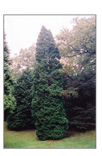
Hetz Wintergreen Arborvitae

A tall, narrowly columnar evergreen tree with dark green foliage which holds its color well in winter; makes an excellent articulation tree or very tall hegde, hardy and adaptable, takes pruning well; best with some sun, protect from drying winds