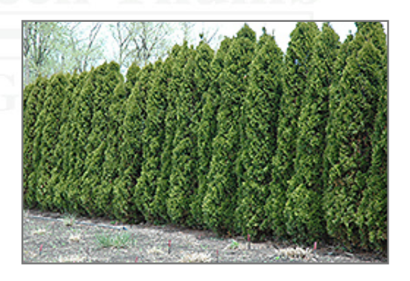
Hetz Wintergreen Arborvitae

This is a relatively low maintenance tree. When pruning is necessary, it is recommended to only trim back the new growth of the current season, other than to remove any dieback. It has no significant negative characteristics.