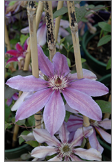
Starry Nights Clematis flowers