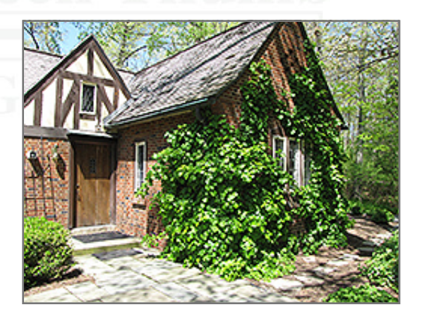
Climbing Hydrangea