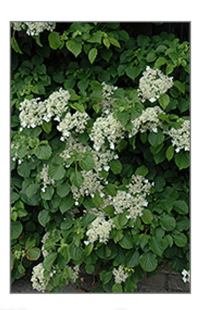
Climbing Hydrangea flowers

Climbing Hydrangea is recommended for the following landscape applications;