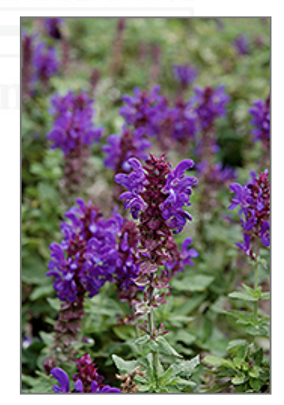
Blue Marvel Meadow Sage flowers