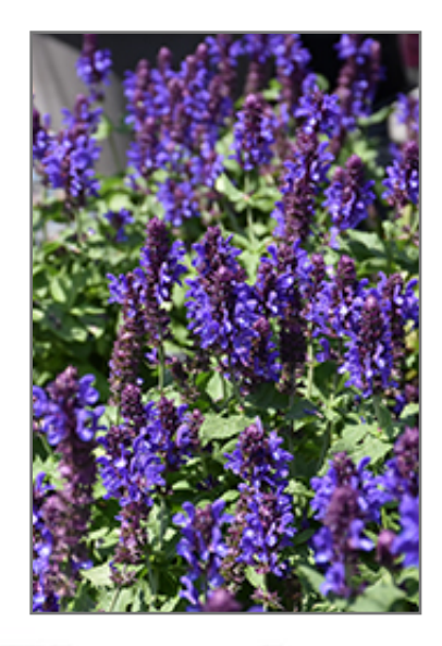
Blue Marvel Meadow Sage flowers

Blue Marvel Meadow Sage is recommended for the following landscape applications;