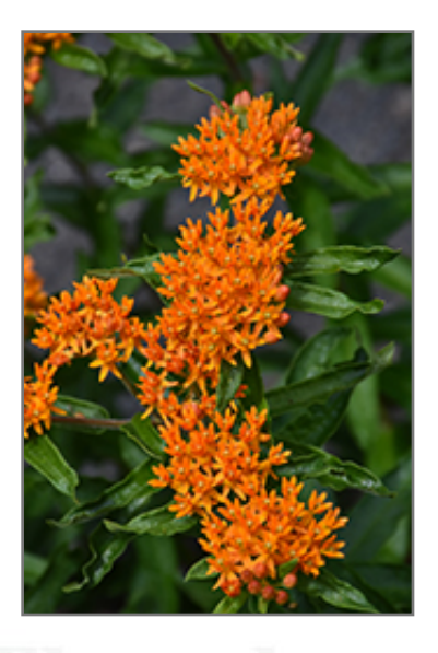
Butterfly Weed flowers

Butterfly Weed is recommended for the following landscape applications;