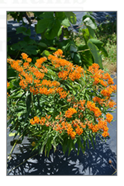
Butterfly Weed in bloom