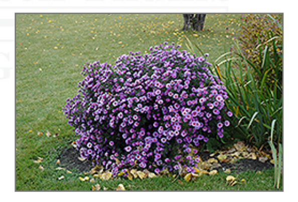
Purple Dome Aster in bloom