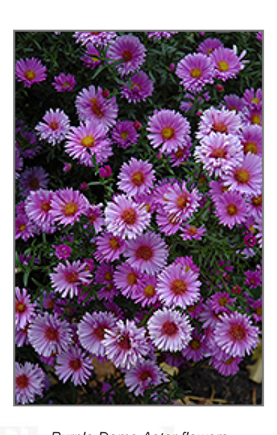
Purple Dome Aster flowers

This is a relatively low maintenance plant, and is best cleaned up in early spring before it resumes active growth for the season. It is a good choice for attracting butterflies to your yard, but is not particularly attractive to deer who tend to leave it alone in favor of tastier treats. Gardeners should be aware of the following characteristic(s) that may warrant special consideration;