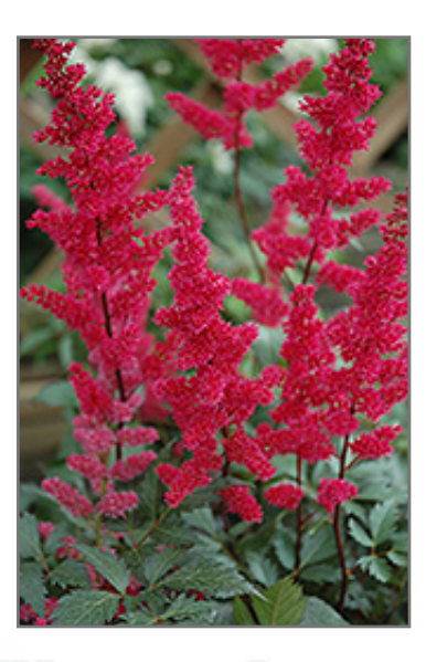
Fanal Astilbe flowers

This early summer bloomer produces tall stems of ruby red plumes that stand out in shaded gardens, borders or containers; vigorous upright habit with low mounding deep green foliage; easy to grow, requiring little to no maintenance; excellent freshly cut