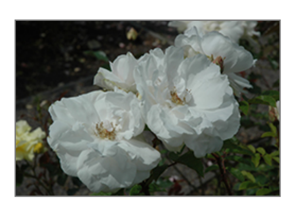
Sir Thomas Lipton Rose flowers

A hardy rugosa hybrid producing clusters of fragrant, bright white double flowers from early summer until frost; leathery dark green foliage is very disease resistant and vigorous